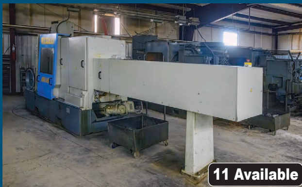
Wickman Multi-Spindle Bar Machine