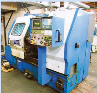
Femco Model WNCL-50 CNC Turning Center