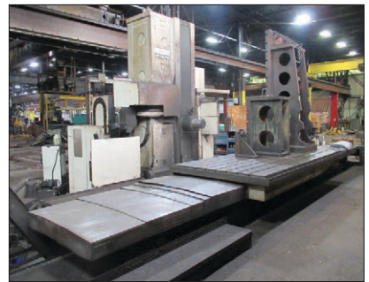
Toshiba BP-130.P40 Boring Mill

Day 1: Webcast Auction – January 31 at 10am CT