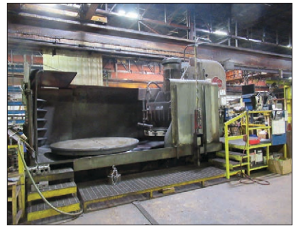
Blanchard 120 in. Rotary Grinder