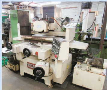
Kent Model KGS-300 AHD 12" x 24" Hydraulic Surface Grinder