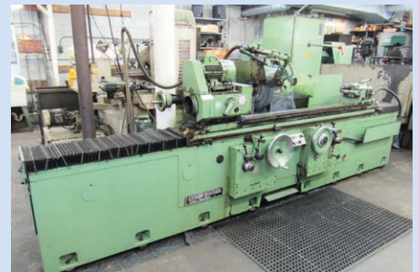
Kikinda Type C12 1600 14" x 63" Universal Cylindrical Grinder