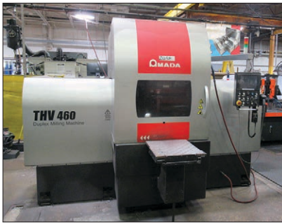
Amada THV 460 CNC Duplex Mill

Featuring: (50+) CNC Machines! Including 2020 and 2021 Doosan DBM2540 and 2550 Bridge Mills • CNC Duplex Mills • CNC Haas, Mazak and Makino Machining Centers • HUGE Assortment of Tooling • Toshiba Boring Mills • Cosen and Hem Saws • (11) Blanchard Rotary Surface Grinders 30" to 120" • Material Handling Equipment and Much More!