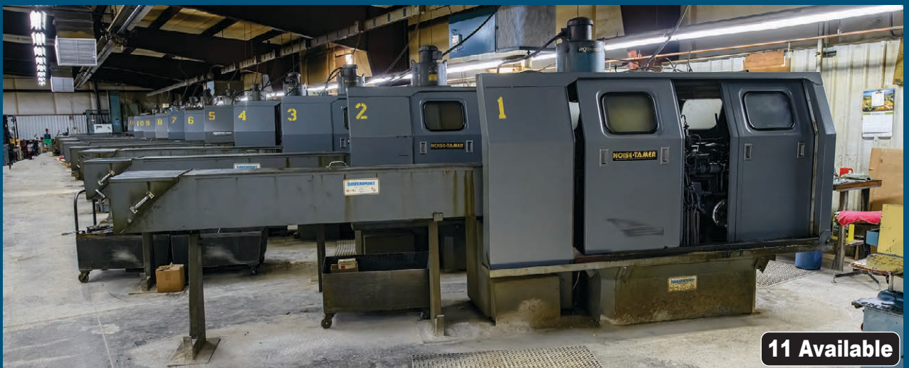
View of Davenport Multi-Spindle Bar Machines

INSPECTION LOCATION: H&W Machine Company – 11604 Teller Street, Broomfield, CO 80020