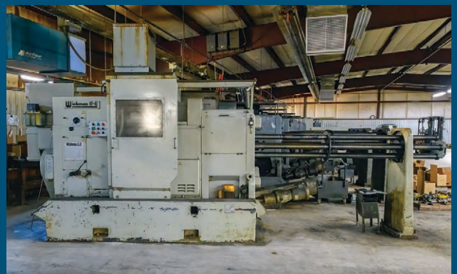
Wickman 1-3/8" 6-Spindle Automatic Bar Machine

Please contact Robert Levy rlevy@rlevyinc.com for additional information, or go to: www.rlevyinc.com/project/1813/ or www.bid.orbitbid.com/auctions/9891/info