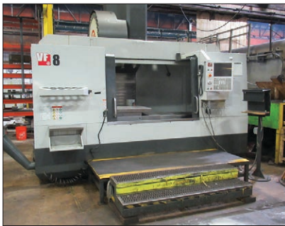
Haas VF-8/50 Vertical Machining Center