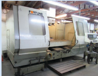
Fortune Vcenter 140 Machining Center