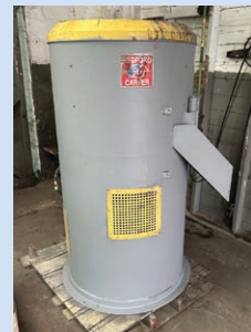
Redford Carver 2GF Batch Muller