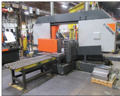
Cosen C-1000NC Auto. Horizontal Bandsaw